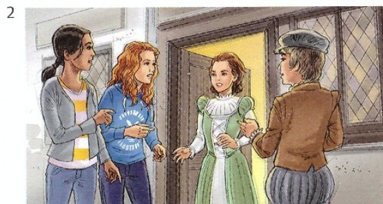
Who are they?